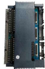
IS410TRLYS1F Termination Module