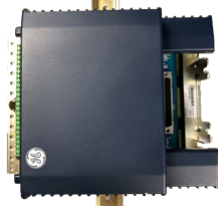
IS410SRLYS2A Terminal Board