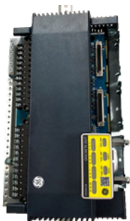
Simplex Relay Contact Output Module