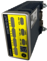
IS420YDOAS1B I/O Pack