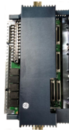
IS410TRLYS1D Termination Board