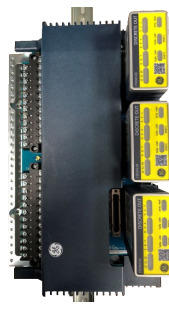
TMR Relay Contact Output Module

The TRLY terminal board is a relay output terminal board used for Simplex or TMR configurations. The TRLY provides integrity feedback on each relay circuit. The YDOA I/O pack(s) mount directly on the TRLY terminal board. The TRLY is available in multiple versions to meet customer requirements. The TRLY Terminal Board with YDOA I/O Pack Specifications table provides the specifications for the TRLY versions available for use in the Mark VIeS Functional Safety System.