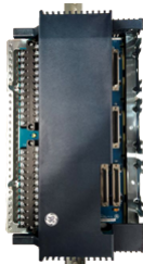
IS410TRLYS1B Terminal Board